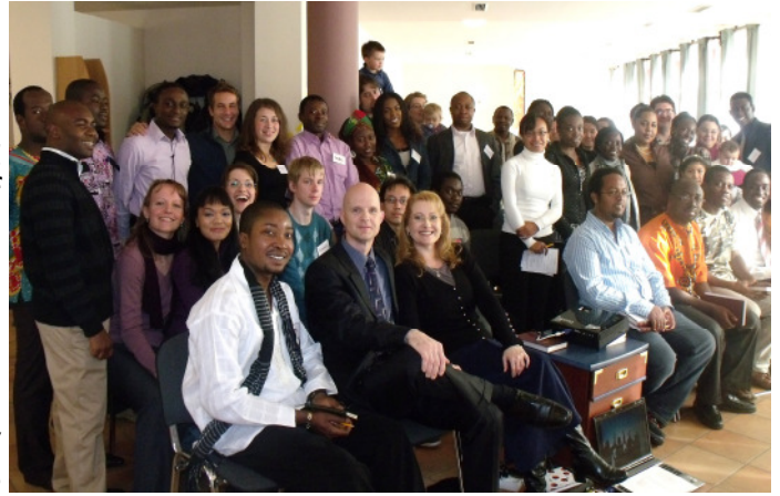
Sunday morning at IBC Dresden

We know the Lord has us here for His purpose and we want to fulfill it by always being available to what He wants to do in and through His church here in Dresden. There is so much more to do and so many more souls who need to hear the gospel. And we want you to be encouraged as well, because your prayers and financial sacrifice of giving is making a difference.