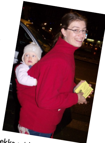
Bekka with her mommy cruising around handing out flyers!!