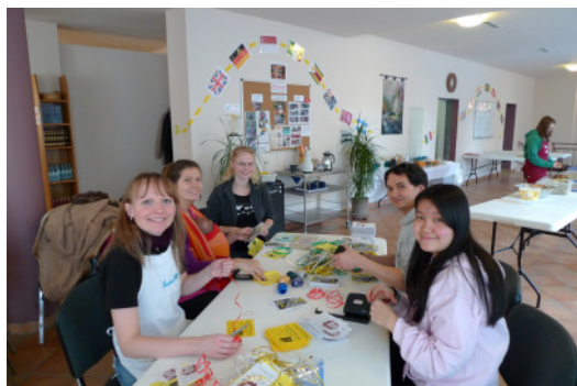
There was more than just cooking, preparations for putting tracts and flyers also was a crucial part of our day