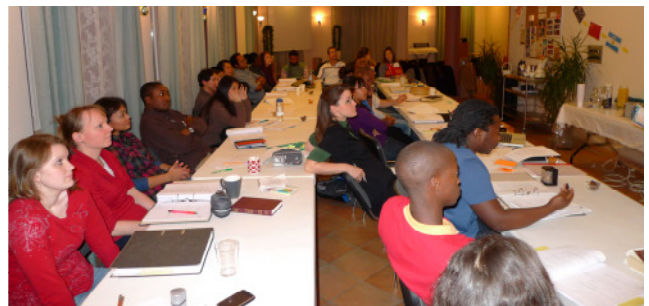
Wednesday Night Bible Study